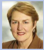
Barbara Young Baroness Young Of Old Scone

Barbara Young was appointed Shadow Chair of the Care Quality Commission from June 2008.