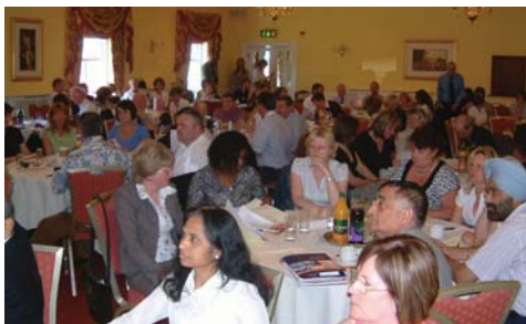
Standing room only at the first Lancashire Learning Together Workshop

There is to be a domiciliary workshop on Tuesday 1st July 2008, at Farington Lodge which will include a focus on the personalisation agenda and its impact on domiciliary care commissioning.