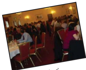
'A Packed Seminar'