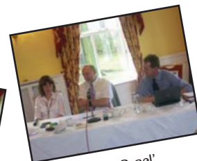
'Questions to Panel'