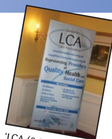
'LCA (& Partners)'